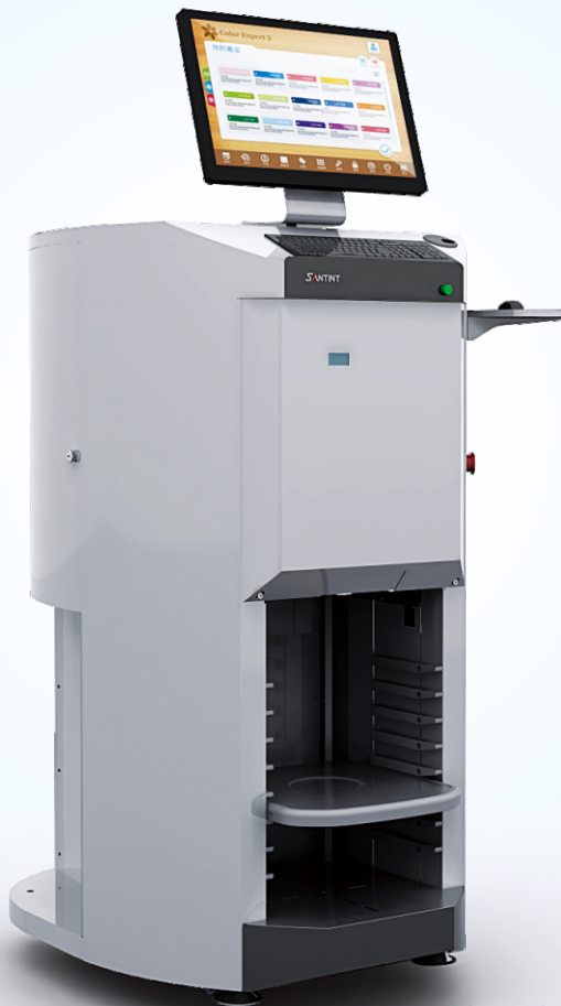
• Manual Can Table Version